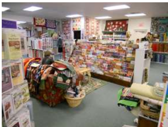
Lots of Books