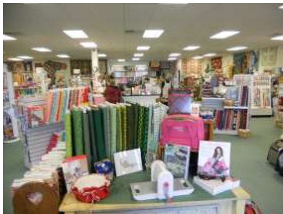
View From The Front Door